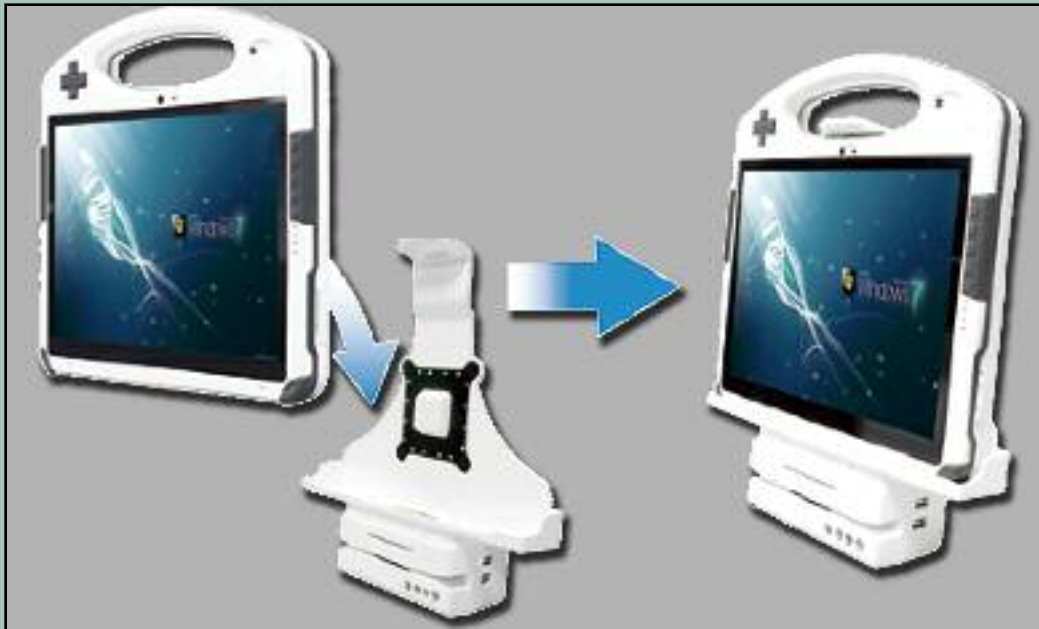
RAM-ball Mount Cradle for Guardian™ Mobile Clinical Assistant Model 1060